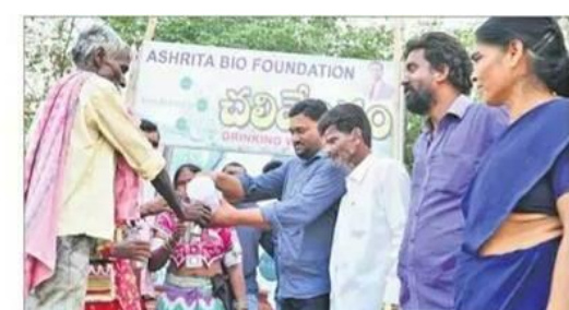
శంషాబాద్ మార్కెట్లో మంగళవారం ఆశ్రిత ఫౌండేషన్ అధ్యర్యంలో చలివేంద్రం ప్రారంభించారు.ఈ కార్యక్రమంలో ఫౌండేషన్ ప్రతినిధులు పాల్గొన్నారు.-శంషాబాద్